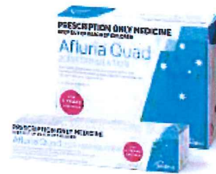
2019 pack shot not yet available.